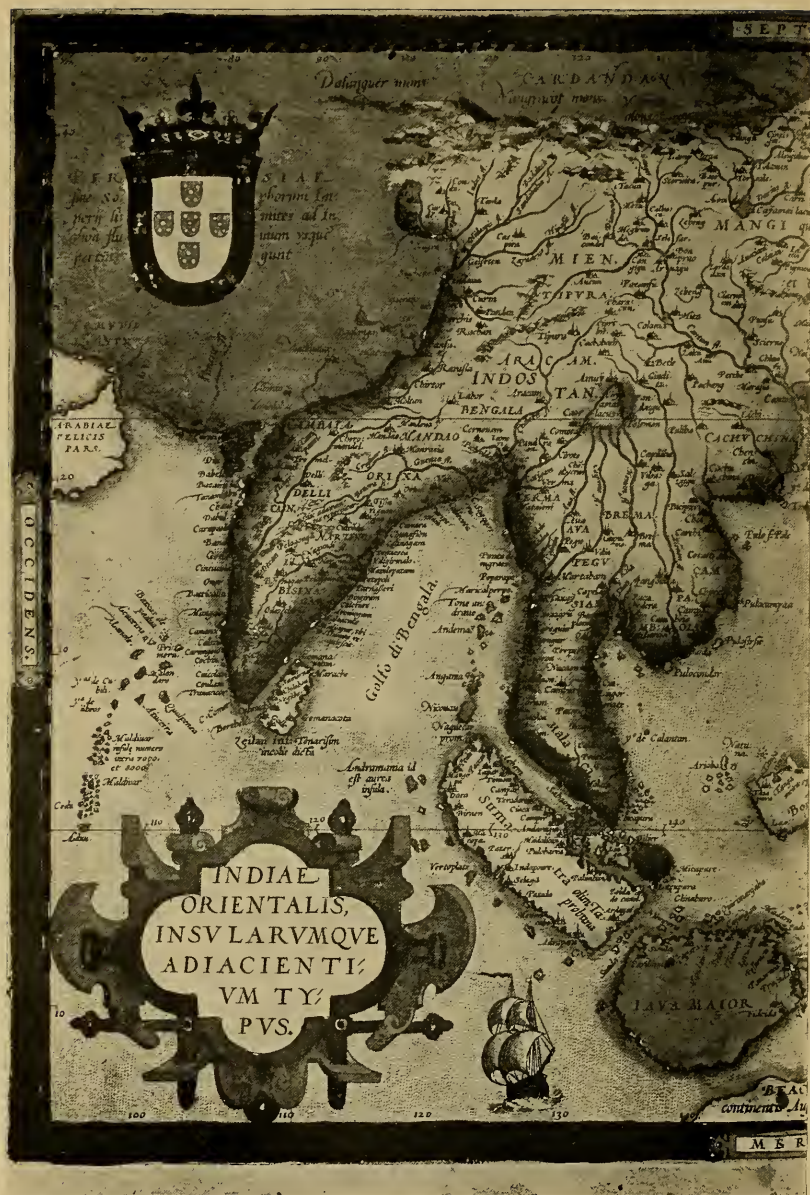
"Indiae orientalis, insu- Abraham Ortelius [From original (in colors),